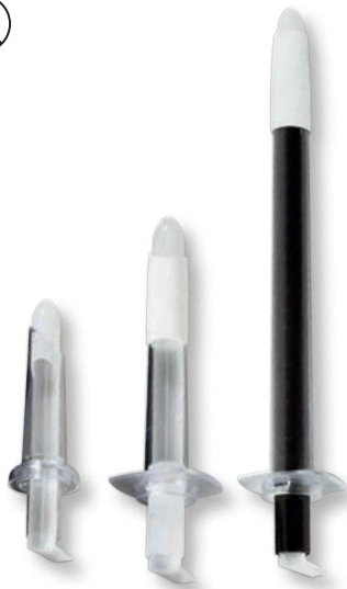
85x20 mm 130x20 mm 250x20 mm