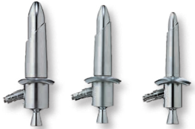
70x25mm 70x20mm 70x15mm

Illumination by Fiber Optic cable and projector, lamp handle or 3.5V BETA handle with illumination adaptor (X-002.98.002).