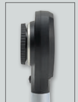
Without contact plate