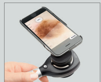
With mobile phone case for iPhone