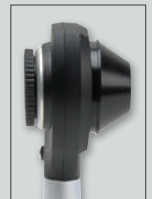
With contact plate