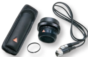
Photo Accessory Set

includes SLR Photo adaptor, adaptor cord, distance ring and BETA Belt Clip